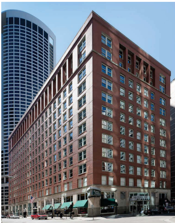
The Railroad Retirement Board is in the Lipinski Federal Building in Chicago.

Until recently, RRB's building had toilets that used three gallons of water per flush. The agency needed to upgrade its fixtures to fulfill Executive Order 13514 for Federal Leadership in Environmental, Energy, and Economic Performance, which mandates that federal agencies reduce potable water use two percent annually through 2020. Using this mandate as a goal, as well as the results of a comprehensive water and energy analysis completed in 2010, RRB's facilities and acquisitions teams worked together on a focused plan that detailed the requirement for specific makes and models of toilets.