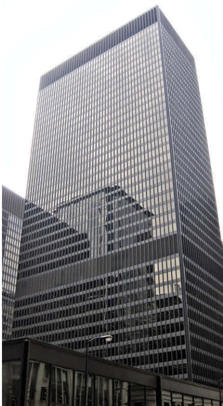
The Office of Personnel Management Nationwide Testing and Oversight Groups are located in the John C. Kluczynski Federal Building in Chicago.

OPM's newly established office green team asked staff to set default printer preferences to double-sided printing.