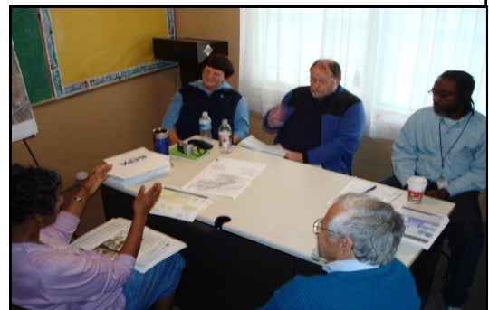
This EPA program will continue to promote community engagement.