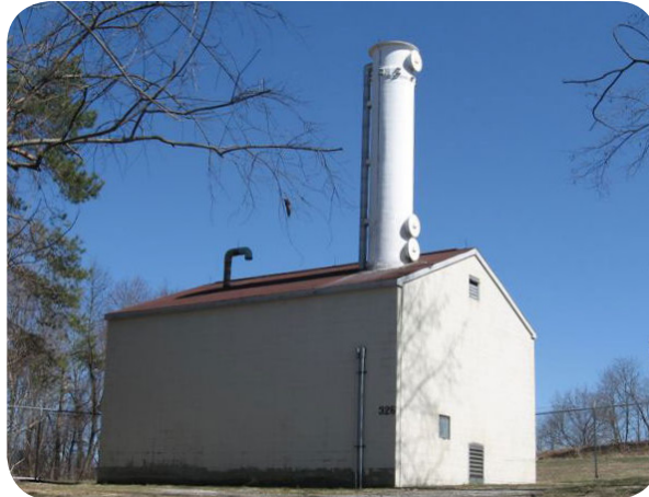
Air stripper and treatment building

Installation of the air stripper and treatment equipment may require use of heavy machinery, especially at large contaminated sites. Area neighborhoods may experience some increased truck traffic as the equipment is delivered. Large tanks or columns may be visible from the street and may need to operate for many years. However, care is taken to make sure the operation of air strippers is as quiet as possible.