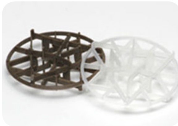
Sample plastic packing material.

Air stripping is an effective way of removing VOCs from contaminated water and is commonly used as part of groundwater pump and treat systems at sites around the country. Air strippers can be brought to the site eliminating the need to pump contaminated water for offsite treatment.