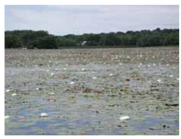
Figure 6: Charles River at Milford Pond

Figure 6 depicts floating solids in the form of plant life that impair primary and secondary uses of the Charles River at one of its impoundments, Milford Pond. Algae and scum also cause aesthetically objectionable conditions, as outlined in the aesthetic standards violations section below.