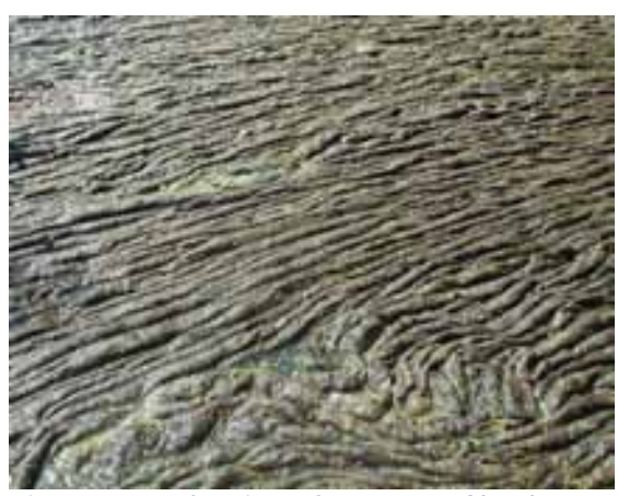
Figure 5: Floating Scum at Charles River in Medway