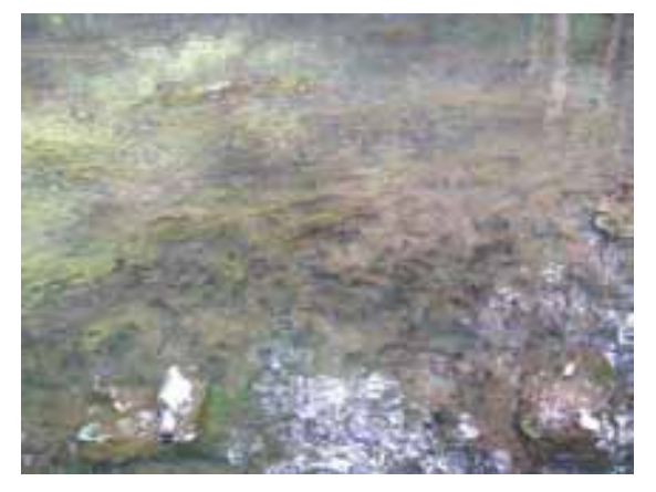
Figure 7: Attached Algae on Charles at Franklin

Overabundant algae and aquatic plants caused by excess phosphorus produce suspended and settleable solids in concentrations and combinations that impair assigned uses, harm benthic biota and degrade the chemical composition of the bottom. Harm to benthic biota occurs through the degradation of habitat and changes in water quality in a number of ways. First, proliferation of attached algae (i.e., periphyton) along the bottom of the river causes a loss of desirable fish habitat and a loss of diversity in the benthic invertebrate community. Figure 7 shows dense growths of attached algae in the mainstem of the Charles River in Franklin. The bottom substrate is almost entirely covered by thick mats of algae that eliminate nooks and crannies among the rocks and cobbles providing important habitat to benthic organisms and small fish. As noted in the discussion on nutrients immediately above, phosphorus and the algal growth to which it contributes degrades the chemical composition of the water by lowering DO levels, as well.