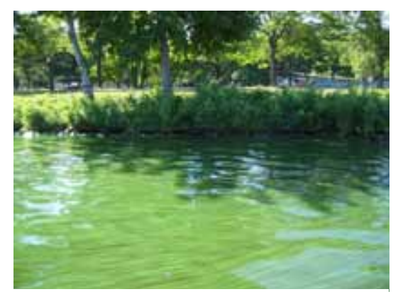
Figure 8: Blue-Green Bloom in the Lower Charles River, August 2006

bloom, DEP collected and analyzed samples from a bloom that began in Populatic Pond and that had cell counts of over 200,000 cells/ml (Beskenis 2005), a level that is ten times greater than the concentration at which aesthetic conditions become impaired, as discussed below.