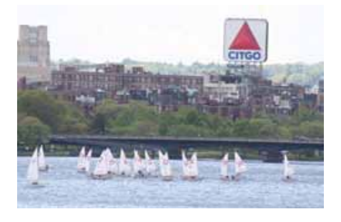
Figure 2: Sailboat Racing on the Lower Charles River (Walsh-Rogalski)

Milford, Franklin and Bellingham, Massachusetts drain, in whole or in part, into the Charles River upstream of the Watertown Dam. As indicated in Figure 1, these communities are located in the upper Charles River watershed. These upper watershed communities are the first places where the Charles River shows significant signs of cultural eutrophication (MAEOEA, 2008; CRWA, 2004 and 2006; Beskinis, 2005). The portion of the Charles River that is downstream of the Watertown Dam is referred to as the Lower Charles River. The Lower Charles River is one of the most historically and culturally significant rivers in the United States. The river and its adjacent parkland are used by the public for recreation, including windsurfing, sailing, rowing, running, and other water and non-water related recreation by an estimated 20,000 people on an average day (Breault et al., 2002).