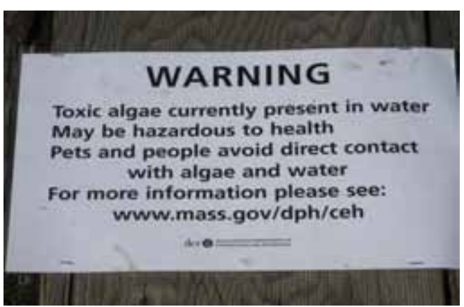
Figure 4: MA DPH posting along the Banks of the Lower Charles River in August 2006 (by CRWA)

consumes algae and is, in turn, preyed upon by many fish species. Three genera of cyanobacteria -- Anabaena, Aphanizomenon, and Microcystes -- are commonly associated with the spread of cyanobacteria in fresh water lakes (Mattson et al., 2003; USEPA, 2003; DEP et al., 2007). All three genera have been consistently observed in the Lower Charles River during all summers when algal sampling was conducted (DEP et al., 2007). During the summers of 2006 and 2007, very severe blooms occurred in the Lower Charles River, causing the Massachusetts Department of Public Health and the Massachusetts Department of Conservation and Recreation to post warnings for the public and their pets to avoid contact with the river water. This included recreational uses -- such as windsurfing and kayaking -- that have become commonplace as bacterial contamination has been dramatically reduced.