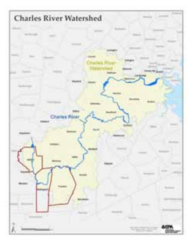
Figure 1: Charles River watershed with Milford, Bellingham and Franklin Outlined

The entire Charles River drains a watershed area of 310 square miles (MAEOEA, 2008). Two hundred and sixty-eight square miles of that watershed area drain over the Watertown Dam into the Lower Charles River (Breault et al., 2002). The remaining 42 square miles drain directly into the Lower Charles River. There is also a combined sewer drainage area near the downstream end of the Lower Charles River.