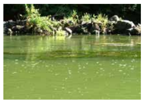
Figure 9: Blue-green Bloom in Populatic Pond (DEP September 2004)