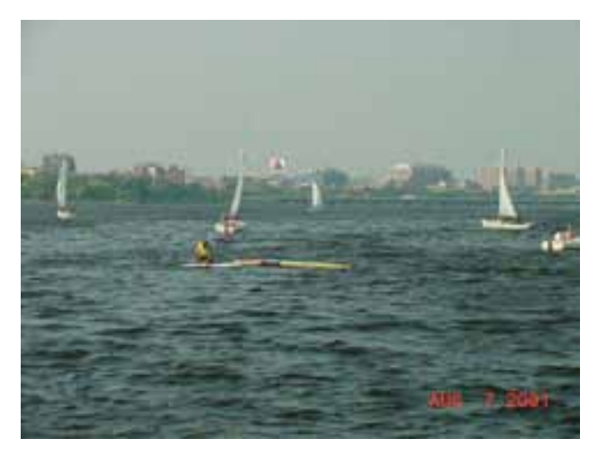
Figure 3: Windsurfing on the Lower Charles River

In 1995 EPA Region I launched the Clean Charles initiative aimed at making the Lower Charles River fishable and swimmable—the goals of the CWA. At that time, the Lower Charles River was meeting swimming standards for bacteria 19% of the time and boating standards for bacteria 39% of the time based on Charles River Watershed Association (CRWA) data. (EPA, 2008) In 2007, the Lower Charles River was meeting the bacteria standard for swimming 63% of