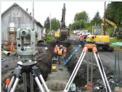
Workers replacing sewer mains

Excessive inflow and infiltration in Bay View subdivision in Klawock, AK regularly brought more wastewater to Klawock's wastewater system than it could safely treat. High tide events would also bring seawater infiltration into the system which corroded pipes. As a result, the wastewater treatment plant's approved capacity was often exceeded, especially during rain events where the plant was receiving double the approved capacity. The excessive flow into and out of the system was increasing the maintenance costs and causing public health threats. By replacing the sewer mains, the flow into the wastewater treatment plant was reduced by approximately 30%, meeting the system's capacity limit. As a result, sludge production has been reduced by 20%, decreasing pressure and operating costs at the water treatment plant and avoiding costly upgrades to increase capacity.