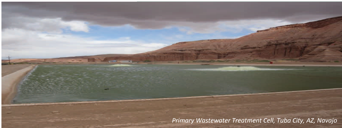
Primary Wastewater Treatment Cell, Tuba City, AZ, Navajo