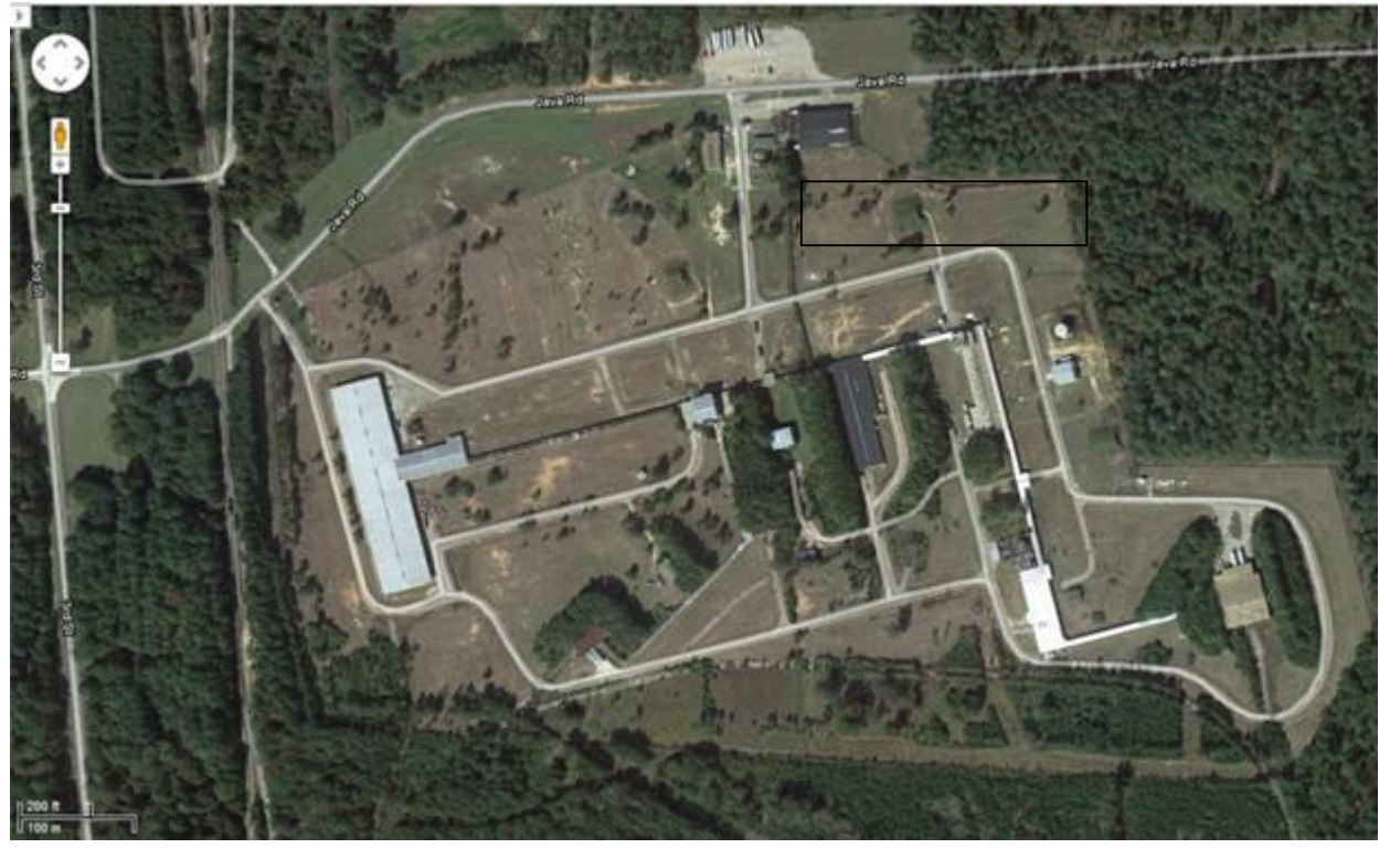
Explo Systems, Inc., S-Line, Camp Minden

During the action overseen by the Louisiana State Police, Explo moved the unsecured explosives (discovered on November 27, 2012) to explosive storage magazines. Explosives from Explo occupied 97 magazines at Camp Minden, currently 92 magazines. The magazines storing the explosives are located in explosive storage areas known as L-1, L-2, L-3, and L-4. Three configurations of explosives magazines exist at Camp Minden. Each magazine holds a maximum of 125,000 lbs. or 300,000 lbs. of explosives, depending on the configuration of the magazine, the type of packaging, and type of explosives stored within each magazine. The magazines are deteriorating which increases the risk of an explosion. Currently, extensive and intrusive vegetation on the tops and sides of the magazines is impacting the structural integrity of the magazines allowing the intrusion of moisture into the magazines.