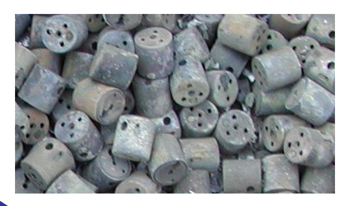
Safe and Clean