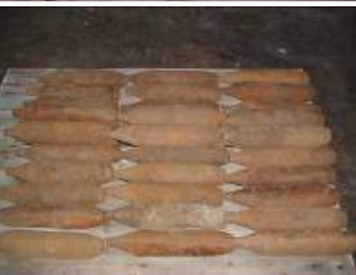
Recovered Munitions Before Destruction