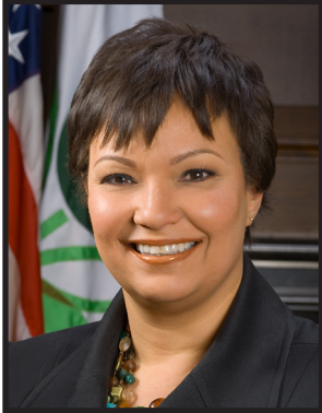
Lisa P. Jackson EPA Administrator

Since being named President Obama's cabinet member in charge of environmental protection, EPA Administrator Lisa P. Jackson has been named one of Newsweek's "Most Important People in 2010," featured on Time Magazine's 2010 and 2011 lists of the "100 Most Influential People in the World," listed in Essence Magazine's "40 Women Who Have Influenced the World," and profiled in O Magazine for her work to protect our nation's air, water and land from pollution that threatens human health.