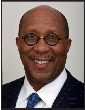
Ron Kirk United States Trade Representative

Ambassador Ron Kirk is the United States Trade Representative (USTR). He is a member of President Obama’s Cabinet and serves as the President’s principal trade advisor, negotiator, and spokesperson on trade issues.