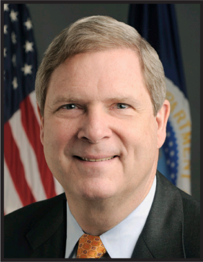
Tom Vilsack Secretary of Agriculture

Throughout his distinguished career in public service as mayor, state senator, and Governor of Iowa, Tom Vilsack has a remarkable record of making positive change in the lives of those he has served.