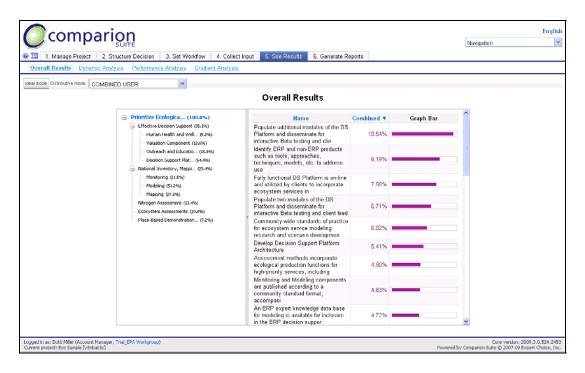
Figure 2. Comparion Screen Shot for Alternatives Rating

The results are presented in a report as shown in Figure 3. This report identifies each alternative, whether it should be funded or not, given the user-specified constraints and budgets, and required personnel requirements and constraints shown in this example as analysts, ecologists, and project managers. This brief example demonstrates the feasibility of going through this process to inform research prioritization at the highest, most strategic levels.