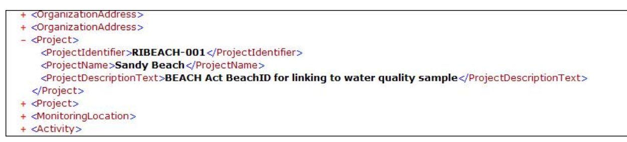
Figure 3. < Project> data elements.

If you use a text editor to view an XML file (as shown in Figure 3), you will see the corresponding data information for each field between the open and close tags.