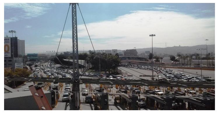
Vehicles backed up in Tijuana at the San Ysidro Port of Entry

General Services Administration (GSA) briefed the AA on the ongoing Port expansion which is expected to reduce vehicle emissions due to shorter wait times; however, GSA has only received partial funding for the expansion, and the completion of the expansion depends on future appropriations. GSA allowed the group access to the roof of the Port building, affording an excellent view of backed-up traffic in Tijuana, literally as