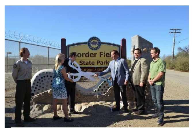
Representatives of State Parks, the San Diego Foundation, EPA, SEMARNAT, BECC and 4Walls

Regional Administrator (RA) Jared Blumenfeld visited the Border Field State Park (Imperial Beach) on January 14th to participate in the inaugural celebration of the binational park space improvements at both Border Field State Park and Los Sauces Park (Tijuana). The park improvements involving construction of park structures made with repurposed trash derived from local cleanups were made possible through the collaboration of EPA with a $25,000 Border 2020 grant and a $20,000 grant from The San Diego Foundation (SDF). The park improvements in Los Sauces Park also involved park cleanup supported by 100 people over 12 weeks and replacement of invasive vegetation with native plants made possible by leveraging Mexico's Ministry of Environment and Natural Resources (SEMARNAT) Temporary Employment Program (PET, in Spanish).