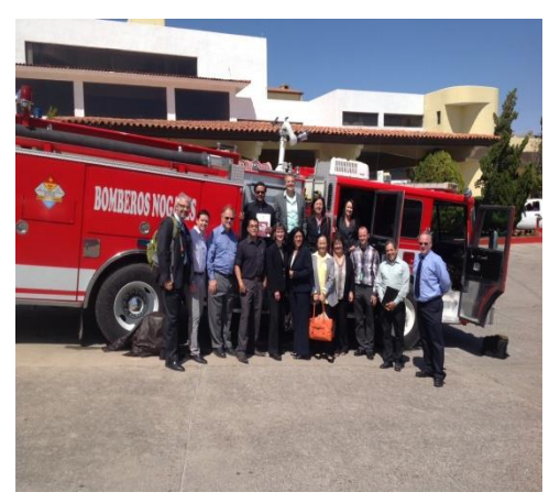
ADEQ and EPA with Nogales Sonora Fire Dept.

California/Baja California Task Force : The Task Force worked the City of Tijuana to test emergency personnel for N1H1 using a flu test kit for emergency personnel. The test kits available in Tijuana had a 3 week laboratory wait time, so partners in Tijuana contacted partners at the San