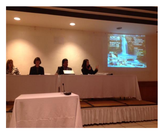
Arizona/Sonora Regional Workgroup Co-Chairs

The Arizona/Sonora Regional Workgroup (RWG) met in Nogales, Sonora on March 26<sup>th</sup>. The meeting included a plenary session lead by the State and Federal Regional Co-Chairs. The meeting was held to continue engaging with border stakeholders on the first year progress of the Border 2020 Program and to begin planning future activities and priorities of the program. The RWG meeting was hosted by the Emergency Preparedness Task Force, which also organized a panel discussion on the progress of Arizona/Sonora binational emergency