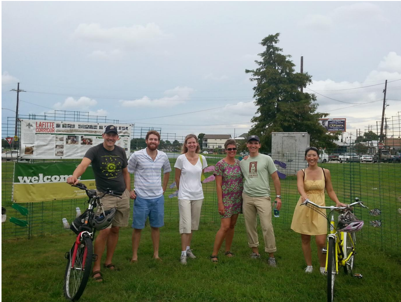
Tour with River Revitalization Foundation, September 2013