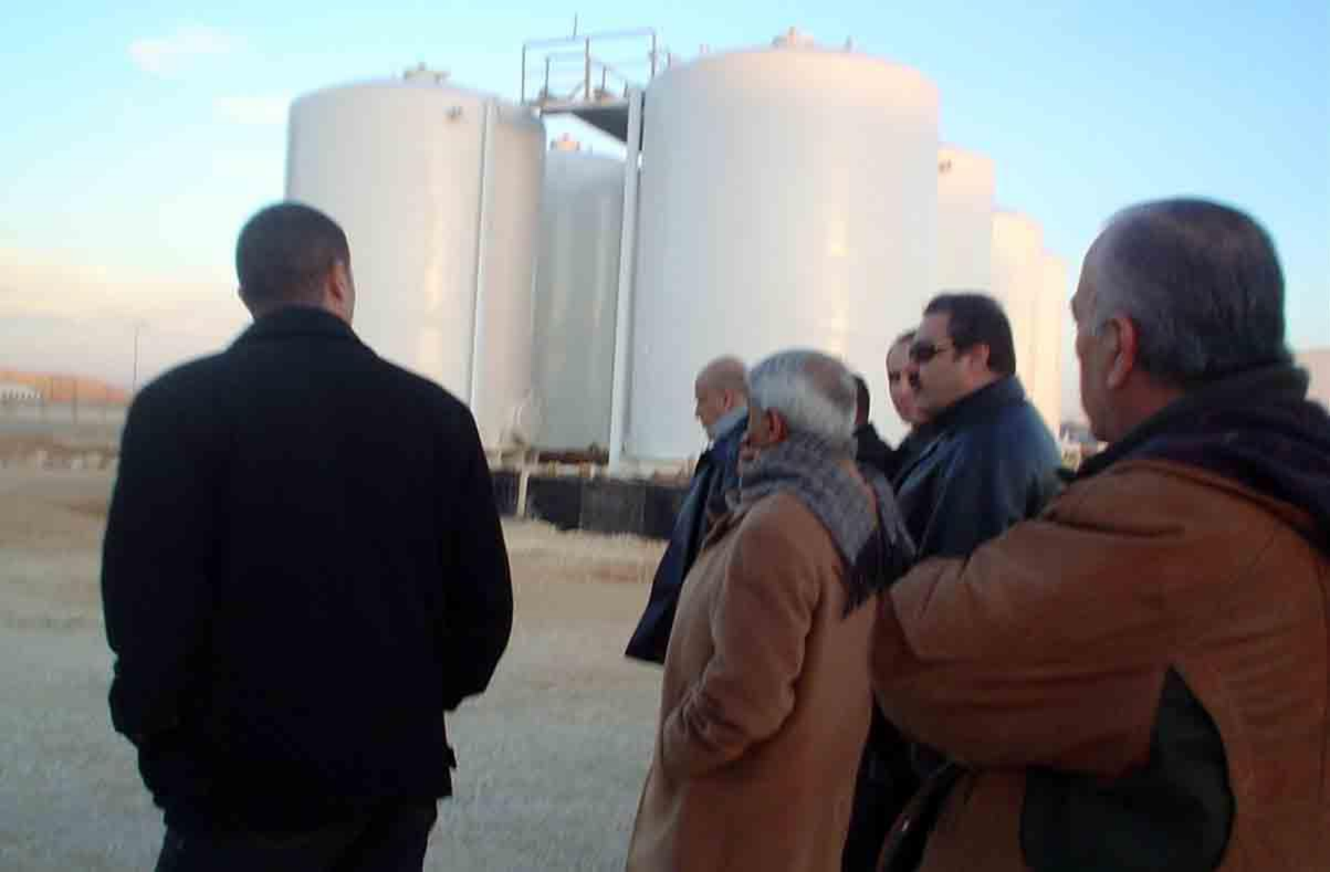
NGOs representatives visited the site