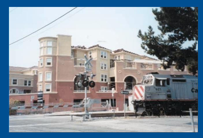
Phase I of the Franklin Street Project, near completion. The project received $1.2 million in TOD Incentive Program funds.

"Redwood City is proud to have received the firstever TOD Incentive grant from C/CAG for Franklin Project Phase I. This project has been well received by the community and will provide 206 new residential units. including 31 affordable units, and convenient retail — all within walking distance to the Caltrain Station and Downtown District employment/services."