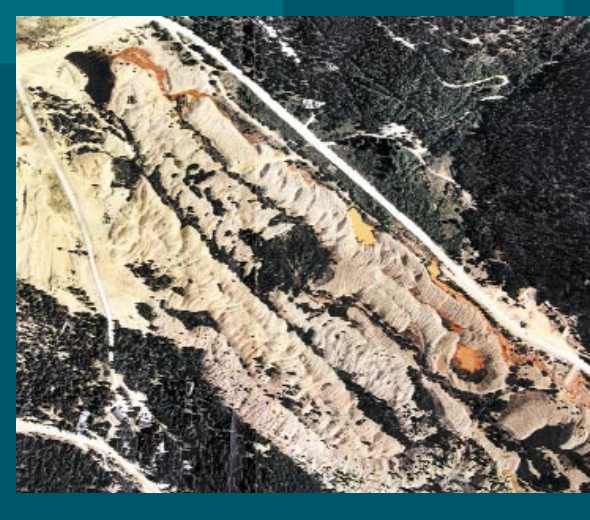
The Wellington Neighborhood sits atop land reclaimed from the Wellington-Oro Mine, which produced gold, silver, and lead until 1972. The site contained 30-foot high piles of river rock.