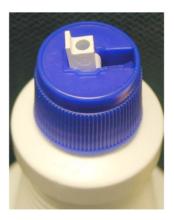
Figure 3A Figure 3B

There are no manufacturer's instructions on the closure.