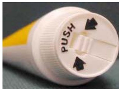
Figure 2B (Black arrows and lettering are for illustration purposes only.)

The snap closure is permanently attached to the container by continuous threads and matching ratchets on the closure and container (see arrow to ratchets on the closure and the bottle in Figure 3).