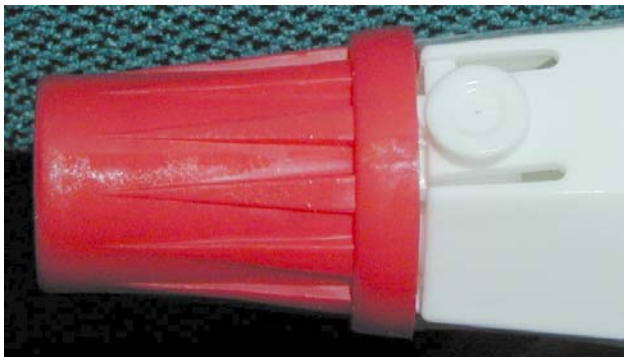
Figure 3A Figure 3B