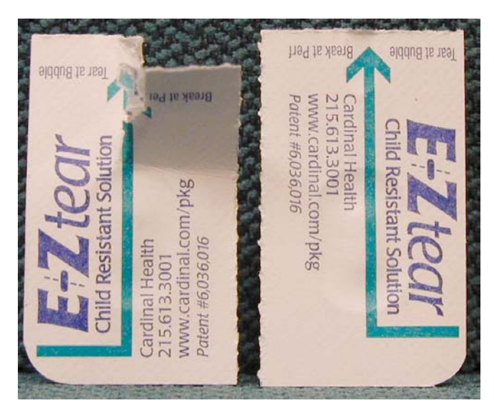
Figure 2A Figure 2B