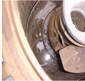
Damaged seal in poor condition

Damaged seals and gaskets can result in non-tight spill buckets. This can allow a release into the environment.