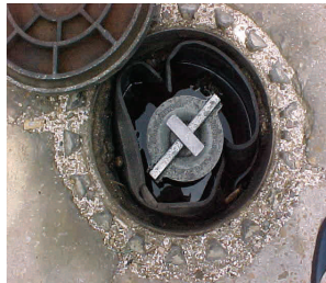
Deformed spill bucket wall

Damaged, cracked, or corroded spill buckets are not liquid-tight and will not contain the spilled product.