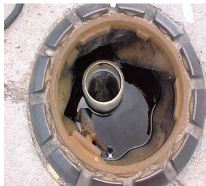
Damaged spill bucket

Perform an integrity test and, if necessary, repair or replace to make sure it works properly.