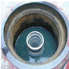
Liquid in spill bucket

Spill buckets are designed to temporarily contain small product spills released during delivery and are not for long-term storage of product. Accumulated debris or liquid reduces containment capacity and ability to prevent spills.