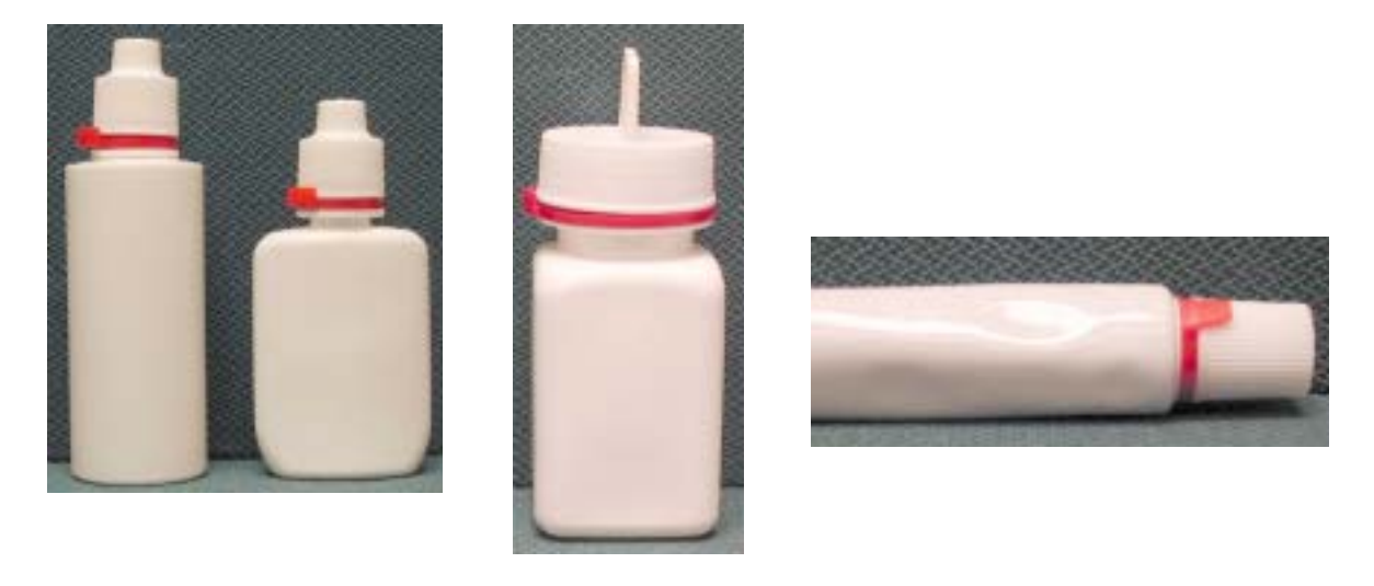
Figure 2A Figure 2B Figure 2C

This closure can be used on a bottle with a dropper nozzle (Figure 2A), a continuous threaded bottle (Figure 2B), or a tube (Figure 2C).