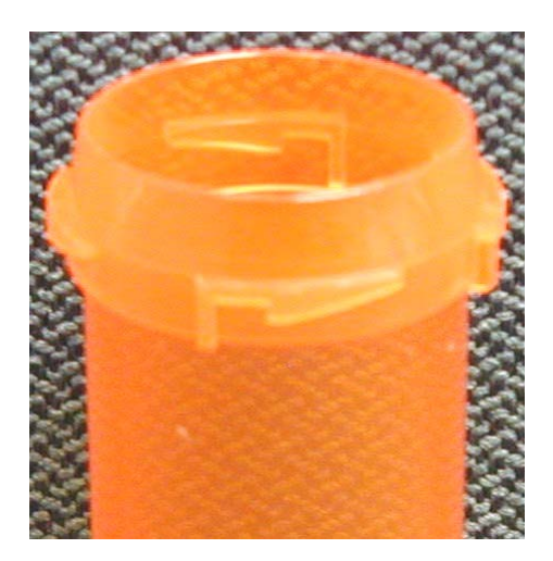
Figure 2A Figure 2B