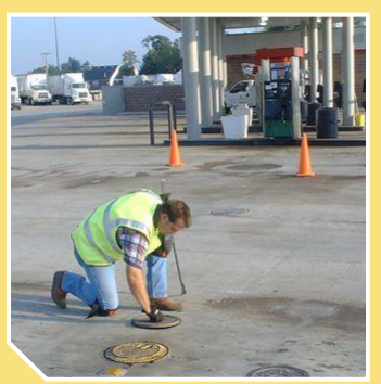
Inspecting a spill bucket

Designating tribal inspectors as authorized representatives of EPA to inspect underground tanks can help increase the geographic coverage and frequency of inspections in Indian country. It also helps enhance relationships and increase the capabilities of tribal inspectors. In 2007, EPA regions first began issuing federal credentials, and so far inspectors from the Eastern Band of the Cherokee Indians, Navajo Nation, Nez Perce Tribe,