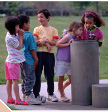
Safe drinking water is a critical resource