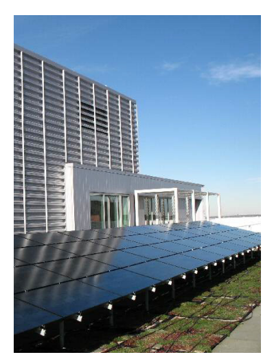
Solar panels on a green roof

a cleanup on the soil, water, and air; and minimizing or eliminating pollution at the source. It's a new way of thinking for some, but worth the effort. A green cleanup may save energy, fuel, and dollars over traditional methods. And with almost 103,000 underground petroleum tank releases in the cleanup backlog, we have a great opportunity to reduce the footprint of cleanup and promote sustainability.