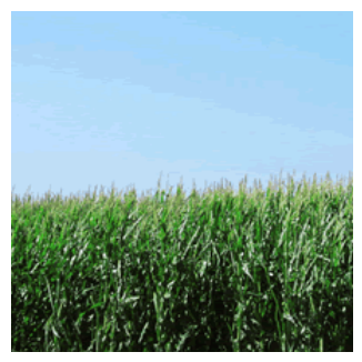
Corn: the primary source of fuel-grade ethanol

About ten years ago, EPA saw an increase in drinking water contaminated with methyl tertiary-butyl ether (MTBE), a chemical added to gasoline to make it burn cleaner and improve air quality. Since underground storage tanks at facilities such as gas stations had historically stored gasoline, diesel, or other petroleum products, this increase in MTBE contamination led to heightened awareness of the potential risks posed by fuel additives. And EPA is facing this challenge again, but with biofuels instead of MTBE.