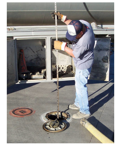
Measuring the product level in a tank

Although we are only in the first three-year inspection cycle, our collective efforts are starting to pay off. After a slight decline, compliance rates are beginning to improve and fewer new leaks are being reported each year. And by continuing our investment in inspections, EPA hopes to see even fewer new releases and a bigger payoff. Preventing just one new release will save $125,000, the estimated average cost to clean up a contaminated site. So it's easy to see that an upfront investment in inspections - our program's ounce of prevention - is certainly worth a pound of cure