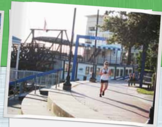
An extended pedestrian path along the Elizabeth River brings Portsmouth's residents back downtown for exercise, picnics, and concerts.

Over an 18-month period, the city rewrote its regulations to create a more walkable, sustainable, and convenient Portsmouth for residents and visitors. The new policies, which encourage redevelopment and infill to use land more efficiently, apply to all properties within city limits and were adopted unanimously by the city council. The regulatory revision makes compact, walkable development by-right, meaning that development proposals that meet these criteria are administratively approved with no need for costly or complicated variances. In addition, city staff can now quickly approve minor adjustments to development proposals. These reforms make the development process more predictable—and therefore easier and more cost-effective—for developers.