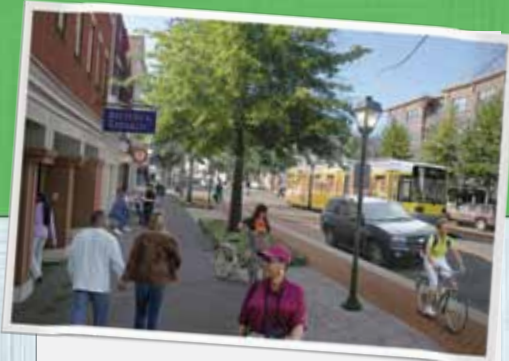
High Street, the heart of Portsmouth's downtown commercial district, will be transformed into a multimodal thoroughfare with mixed-use buildings, light rail, and an inviting streetscape.