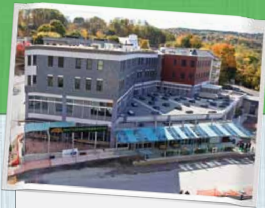
The Cooperative Building helped restore Brattleboro's historic streetscape by putting parking behind the building to make pedestrian access easier.