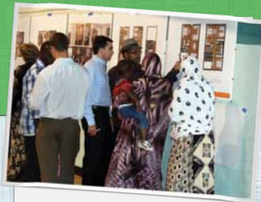
The Denver Housing Authority facilitated over 120 public meetings and community engagement events and translated documents into three languages.

Another main concern for the community was health, specifically the high frequency of obesity, cardiovascular disease, diabetes, and asthma among area residents, along with poor prenatal and senior health care. The community-led development team conducted a health impact assessment for the project and partnered with Denver Health, a public safety net hospital, to assess current conditions and set targets for progress. During the assessment, the team worked with the neighborhood's Boys and Girls Club to complete a Pedestrian Environmental Quality Index to determine the site's walkability and identify areas for improvement. The master plan responds to health concerns by adding sidewalks and pedestrian walkways throughout the development, bicycle lanes and bikeshare stations, secure bike parking in housing units and parking garages, and links between new open spaces and existing parks. Other community health concerns are addressed through education programs such as classes that teach healthy eating and cooking and job-training for young people in health-related fields.