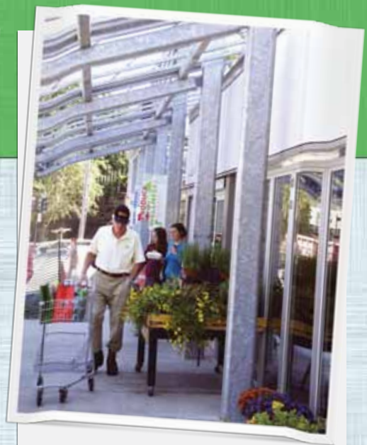
The Cooperative Building's many green features include permeable pavers outside the store entrance, a green roof and energy efficient heating and cooling system.

The co-op's members also wanted to reduce environmental impacts. The site, previously contaminated by a dry-cleaning facility, was cleaned up. The building was moved away from the nearby brook and a green buffer was added to protect the water from pollution and the building from flooding. The building is energy-efficient and includes high-tech insulation, window glazing, and a green roof. An innovative heat exchange system uses heat that would typically be wasted by the co-op's refrigeration equipment to heat the apartments, saving the equivalent of nearly 8,000 gallons of oil per year. The exterior of the building uses local Vermont slate, a natural and durable surface that offers better energy performance than conventional materials, and the development team paid particular care to weatherization and air sealing, an important consideration in Vermont's cold climate. These features have cut per-square-foot energy costs by approximately 50 percent, which helps keep the apartments affordable.