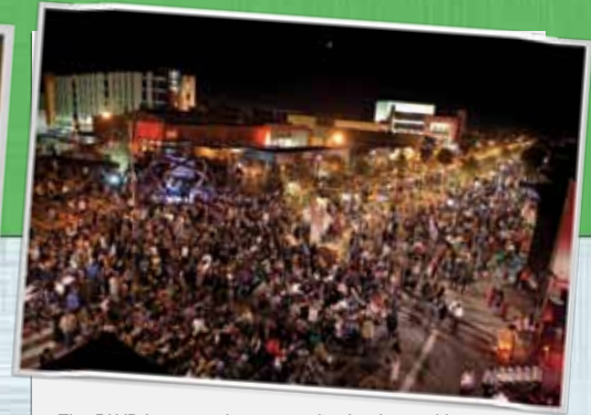
The BLVD is now a downtown destination and hosts regional and community events throughout the year, like the BooLVD Halloween and Harvest Festival.

the merchants’ association. Now renamed The BLVD Association, it focuses on maintaining strong communication between the city and downtown businesses.