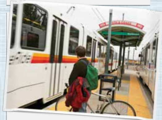
The 10th and Osage light-rail stop quickly and easily connects Mariposa to downtown Denver.

The Mariposa District, slated for completion in 2018, provides affordable, transit-accessible homes to residents of all income levels in a neighborhood that helps people live healthier lives. DHA's efforts to build community trust make sure that the new development meets residents' needs while also preserving Mariposa's exceptional assets: its neighborhood identity, a strong sense of community, and the culture shared by its residents.