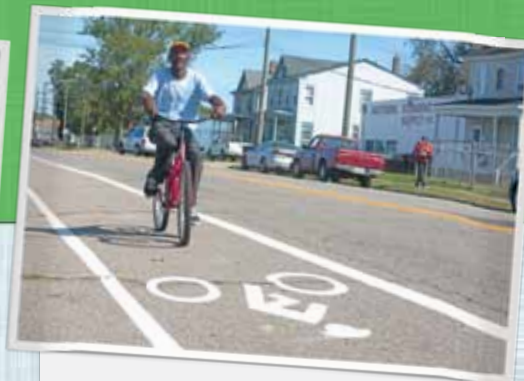
Destination Portsmouth is making streets throughout the city more pedestrian- and bicycle-friendly.