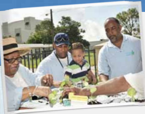
Northwest Gardens' 7,000-square-foot urban farm generates $1,000 worth of vegetables per week and sells food to local restaurants and residents.

By improving the quality of the neighborhood and bringing new residents, Northwest Gardens is continuing to fuel local reinvestment. The housing authority has replaced former public housing with affordable homes, generating enough rent to sustain the development over the long term. Proving that green building, safety, and education are not luxuries, Northwest Gardens has changed a community.