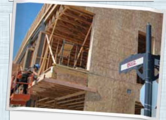
The BLVD has had a huge economic impact on the Lancaster region, generating more than 1,900 full-time jobs and nearly $300 million in economic activity.

The city estimates that the project has resulted in $273 million in economic output and $130 million in private investment. The BLVD Transformation has yielded 48 new locally owned businesses and over 1,900 jobs, offering residents access to shops and stores that would have previously required driving. Now, people can walk from their homes to eat a meal, attend a concert, ride a commuter train that takes them to jobs in Burbank or Los Angeles, buy groceries in a local farmers’ market, or play in a park. The city’s emphasis on communication, coordination, and cooperation helped ensure that The BLVD Transformation took into account the needs and concerns of local residents and businesses to once again make Lancaster Boulevard the heart of the community.