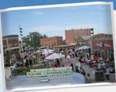
The Larkin District has a number of public plazas and restaurants that bring new life into a formerly industrial area.

Revitalization of the Larkin District benefits the wider Buffalo community. It has demonstrated the market for living and working in a downtown neighborhood, preserved historic character, and brought new local and national businesses. A planned pedestrian-friendly traffic circle in the district would complete Buffalo's Frederick Law Olmsted-designed park system by linking its northern and southern sections, which will open up new recreational amenities and also strengthen Buffalo's historic and cultural connections.