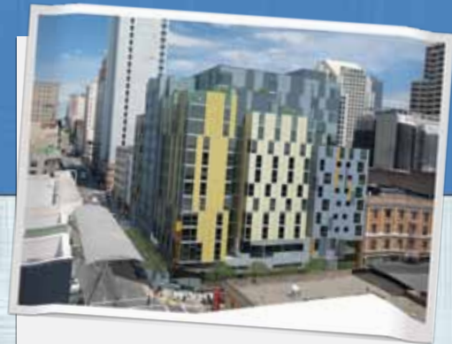
The Eddy & Taylor Building will provide housing for low-income households, plus a ground-floor grocery store to serve the community.

As of 2012, the fund has provided loans to two projects: Eddy & Taylor Family Housing, a 153-unit high-rise for low-income families located two blocks from a major transit station; and Leigh Avenue Senior Apartments, a 64-unit building for seniors that is close to a light-rail station and will provide free transit passes for all residents. In its first 10 years, the fund is expected to finance the construction of 800 to 2,200 affordable, energy-efficient units, which will continue to increase transit-accessible housing options for people in the Bay Area.