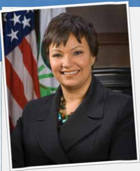
Lisa P. Jackson Administrator U.S. Environmental Protection Agency