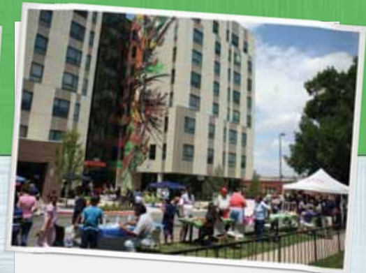
Mariposa is home to a diverse group of residents who benefit from neighborhood events, nearby amenities, and proximity to public transit.

The district uses creative practices to protect the environment. The plan prioritizes walking, biking, and transit, which reduces pollution from vehicles. Green building elements will reduce energy consumption by up to 50 percent across Mariposa, with 75 to 80 percent of building rooftops dedicated to renewable energy. Green infrastructure strategies will reduce stormwater flows into the storm sewers by 80 percent.