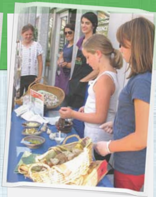
The co-op and its members have a broad commitment to the community. The co-op teaches classes in nutrition and healthy cooking to Brattleboro residents.