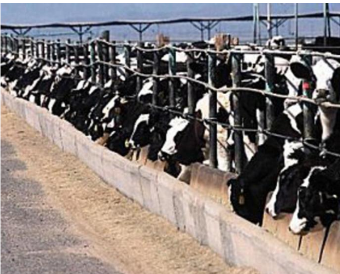
Concentrated Animal Feeding Operation (CAFO)