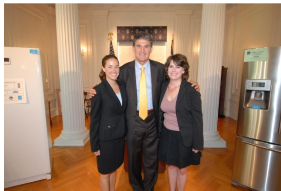
Above: WV becomes first RAD state affiliate (May 2010)