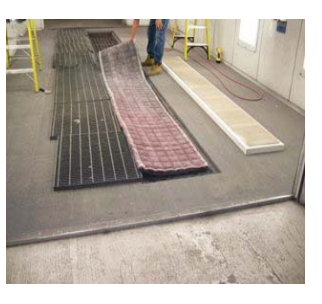
Booth Floor With Dirty Filters

The efficiency of the spray booth operation, as well as the resulting quality of the sprayed finish is affected by both the intake and exhaust filters (also known as paint overspray arrestors). When the intake and paint arrestor filters are well maintained, the air flows evenly through the spray