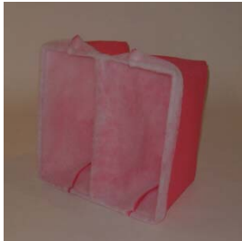
Spray Booth Exhaust Filters Pocket Cube Filter