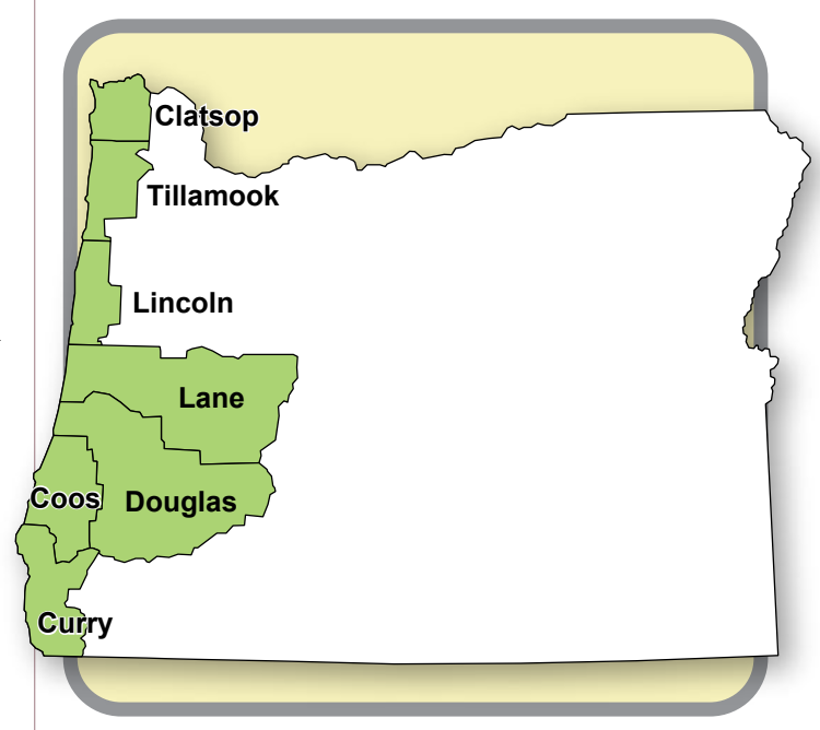
Table 1. Number of monitored and unmonitored coastal beaches by county for 2012