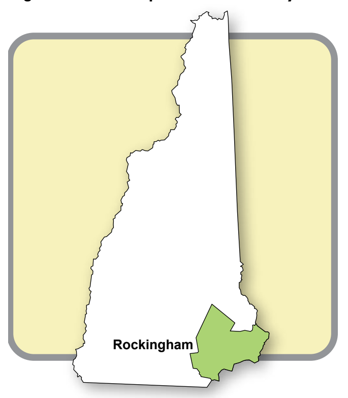
Table 1. Number of monitored and unmonitored coastal beaches by county for 2012