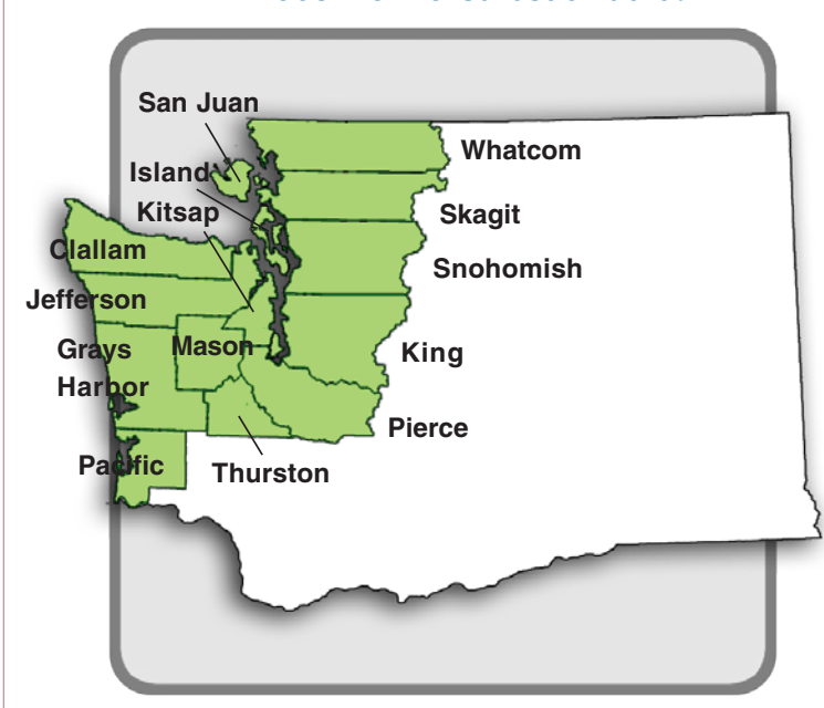
Table 1. Breakdown of monitored and unmonitored coastal beaches by county.