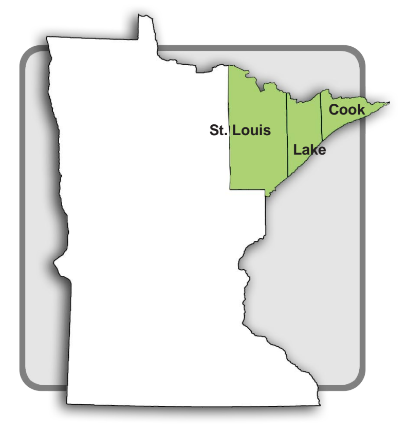
Table 1. Breakdown of monitored and<br/>unmonitored coastal beaches by<br/>county for 2007.