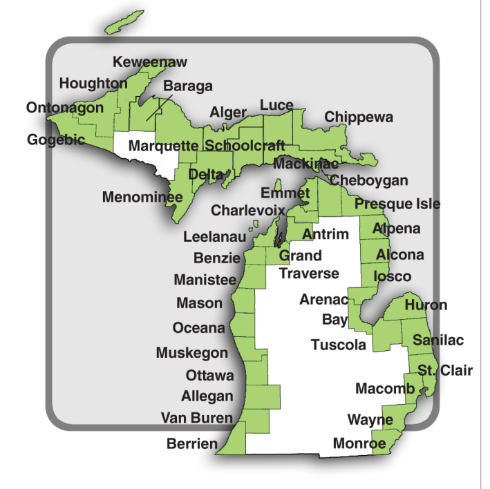
Figure 1. Michigan coastal counties.

This fact sheet summarizes beach monitoring and notification data submitted to EPA by the State of Michigan for the 2010 swimming season.