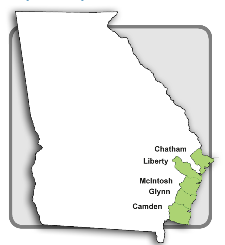
Figure 1. Georgia coastal counties.

This fact sheet summarizes beach monitoring and notification data submitted to EPA by the State of Georgia for the 2010 swimming season.