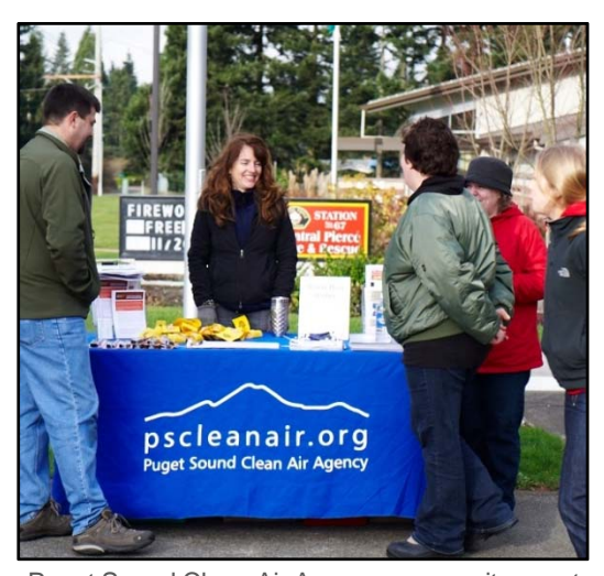
Puget Sound Clean Air Agency community event

Request permission to follow up with households 2 to 3 weeks after the changeout to make sure each household is adjusting to its new appliance. (This may need to be adjusted based on when the stove is installed) There may be questions related to fuel type, flue, doors, or proper venting. A few months later, a complete program evaluation can help provide a better assessment on whether or not the air quality indoors or out has improved. An evaluation also can be