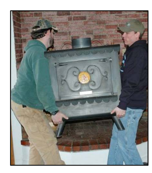
Old Stove Changeout, Libby, Montana

http://www.epa.gov/burnwise/burnwisekit.html.